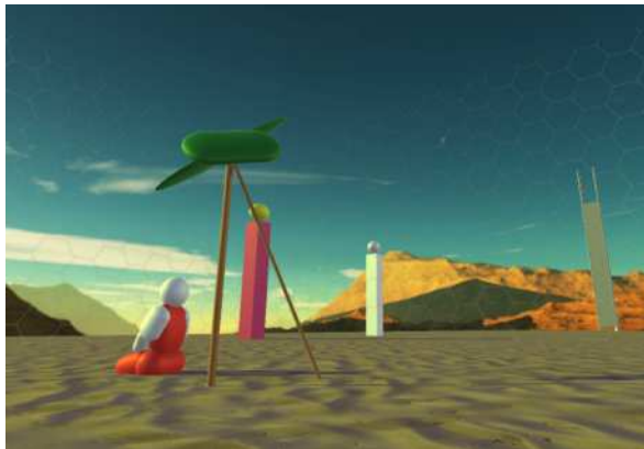
Figure 2: Bronze Age. Structures created by the community around the Genesis parcel, located at coordinates (0,0)

We hosted the first world viewer at decentraland.org/world . Any enthusiast can run a node, download and verify the blockchain, and explore the world by following more advanced instructions 8 .